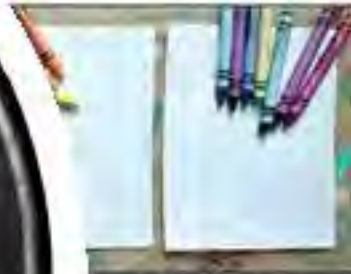
paper, warm colored crayons or cool colored crayons

Explore warm or cool colors by creating a design using line and shape.