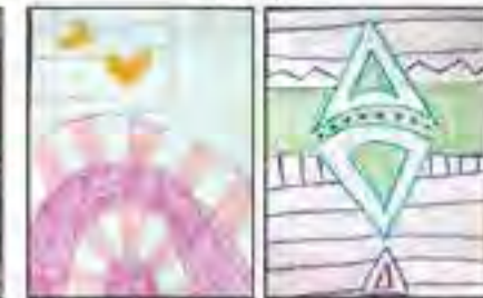
STEP THREE: Fill in the spaces with more lines, shapes, and colors.