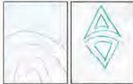
STEP ONE: Start by adding one to three large shapes to your paper.