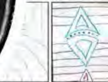
STEP TWO: Fill in the space around your shapes with lines to create a pattern.