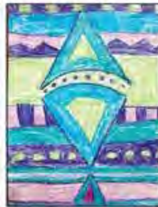
STEP FOUR: Completely fill in your shapes with color until your entire paper is filled with your warm or cool colored design.