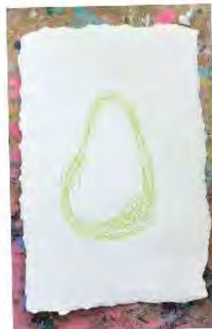
STEP ONE: Draw your base shape.

Once blended, add details such as lines, patterns, texture, or sharpen up highlights and shadows using the edge of your pastel or a pastel pencil.