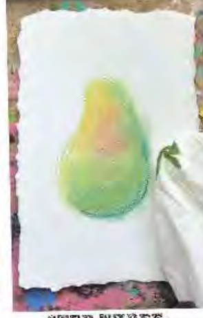
STEP THREE: Blend colors, layer, blend, repeat.