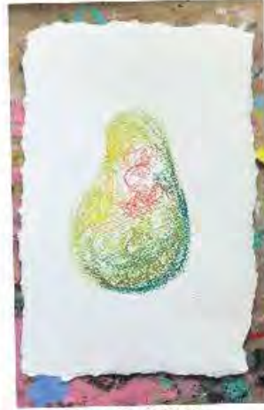
STEP TWO: Block and layer your colors.