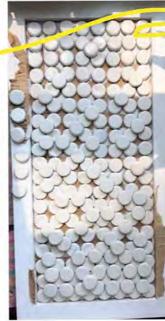
Multiple layers over cardboard