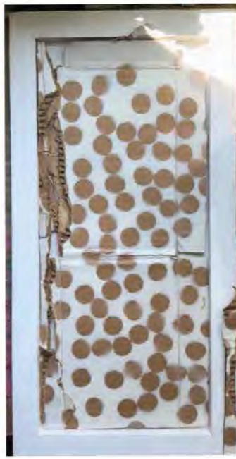
Cardboard as base