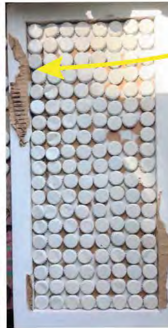
Single layer over cardboard